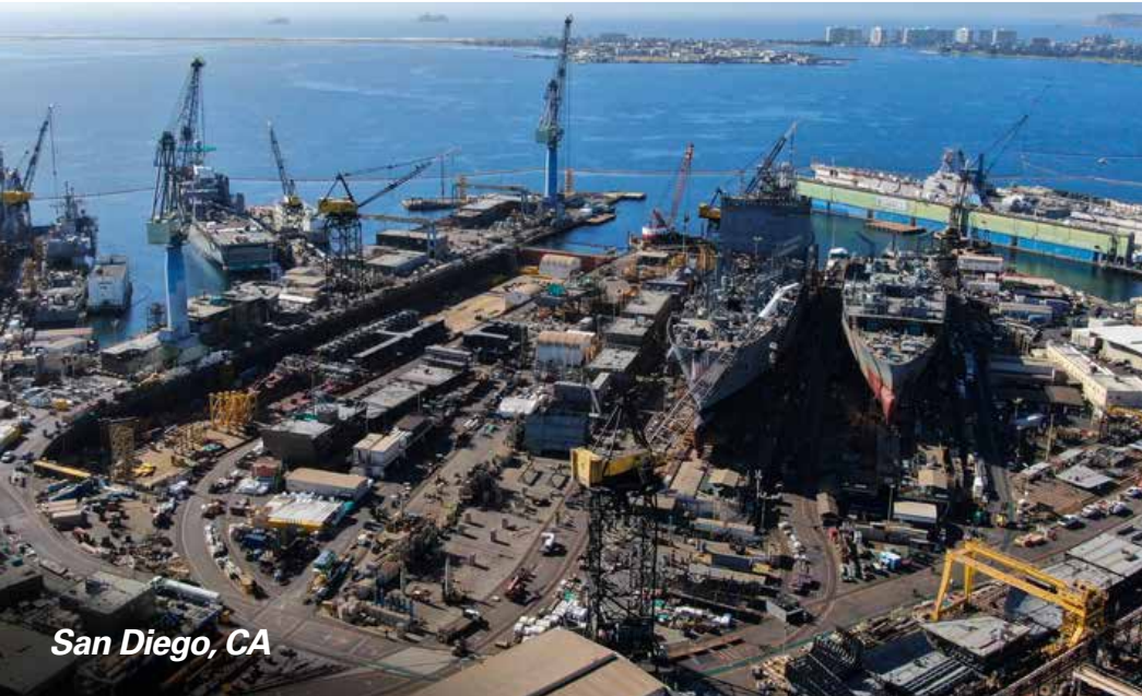
San Diego, CA